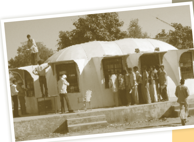
Through a joint venture with an Indian partner, Mississippi-based Domes International is supplying its structures throughout India. Buyers in India find the domes attractive because of their easy maintenance, energy efficiency, and durability.