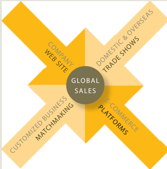
FIGURE 1.2 FOREIGN MARKETS

NUMBER OF FOREIGN MARKETS SOLD TO BY U.S. EXPORTERS, 2005